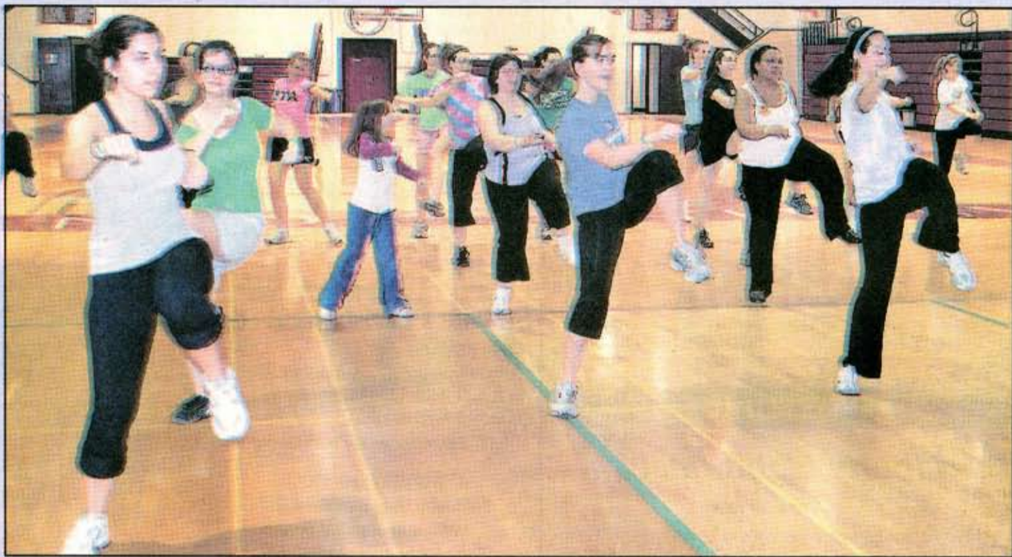
About 70 students participated in a Zumba dance fundraiser at the Cain Athletic Center at Washington College Saturday.